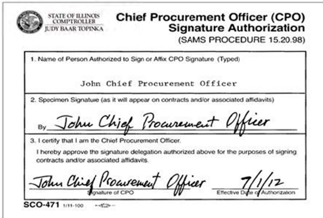
EXAMPLE OF A COMPLETED CARD FOR A CHIEF PROCUREMENT OFFICER