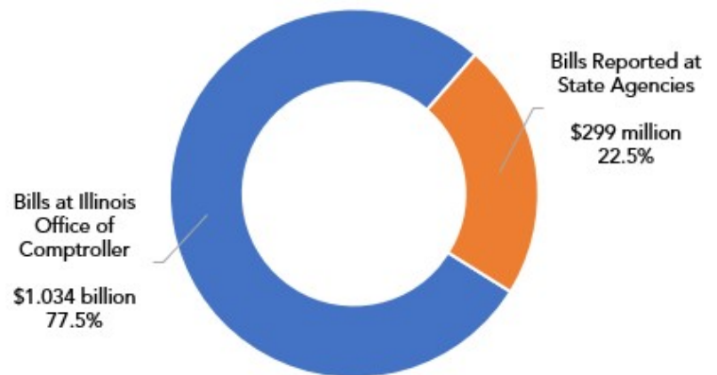
Estimated General Funds Accounts Payable 1 as of December 31, 2024 Total = $1.333 billion

Debt Transparency Report Summary Vol. 8, No. 1 identifies liabilities from General Funds and the Health Insurance Reserve Fund (HIRF) for the state's total accounts payable. 1, 2 Liabilities and details of other state funds utilized by state agencies can be found in agencies' individual submissions available in the Debt Transparency Reports section at illinoiscomptroller.gov .